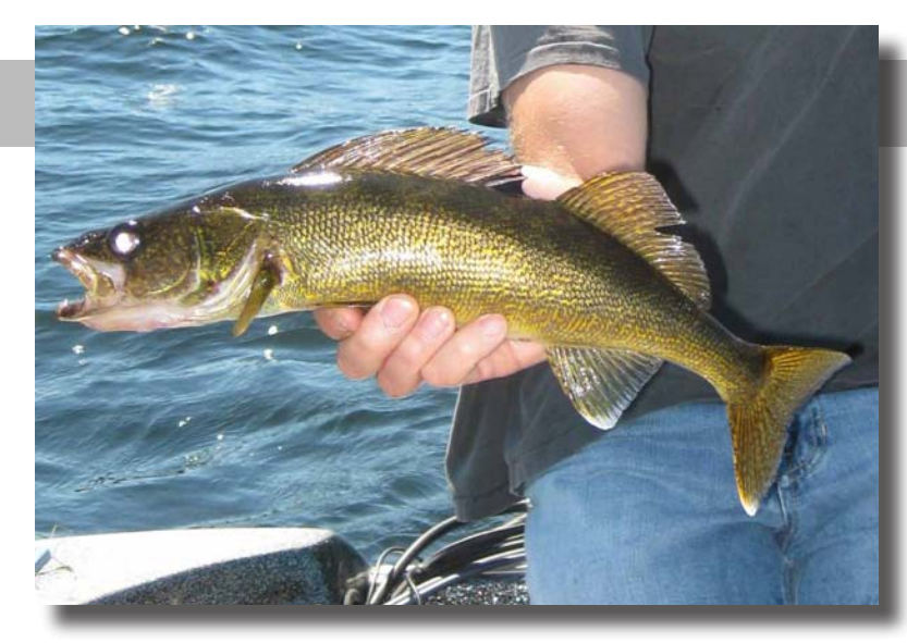
Walleye on Lake Nipissing is open from January 1 to March 15 and from the third Saturday in May to October 15.

Other actions being considered include additional angling opportunities for other species, such as yellow perch, continuing a dialogue with local First Nations regarding the commercial fishery, and community-based stocking.