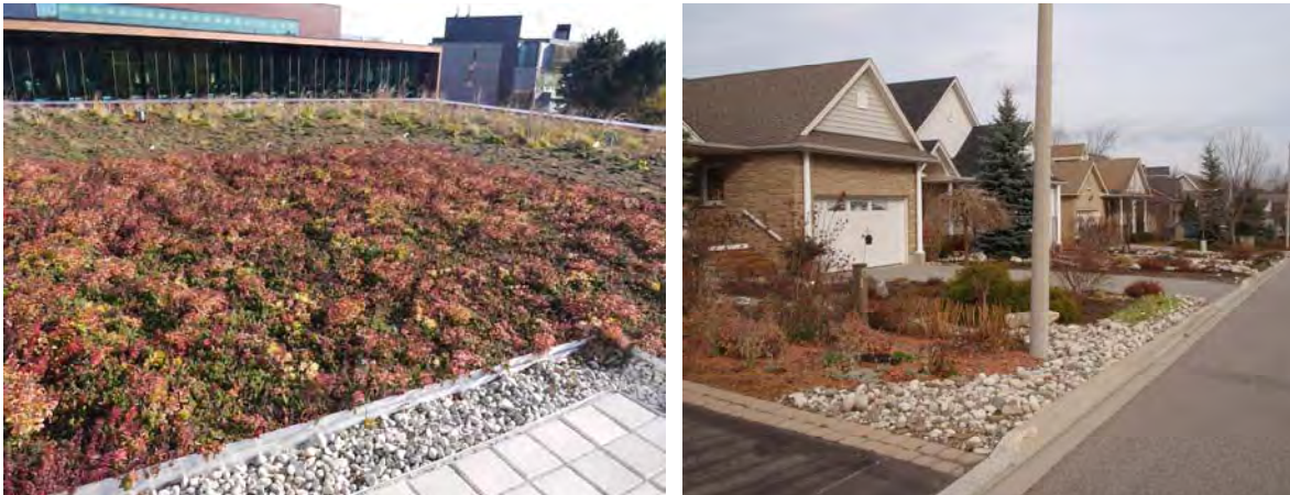
[left] Green roof on Instructional Centre Building, University of Toronto Mississauga (Mississauga, ON) [right] Naturalized landscaping on residential street (Orangeville, ON);

In literature sources, LID may also be called better site design, sustainable urban drainage systems, water sensitive urban design, stormwater source controls, innovative stormwater management, or green infrastructure.