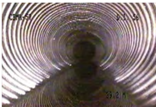
Exhibit 5 Image from CCTV inspection of perforated pipe

Testing at the site found that runoff volumes were 14-27% of those in the conventional system and, due to these lower runoff volumes, the amount of TSS released was reduced by 81-95%.