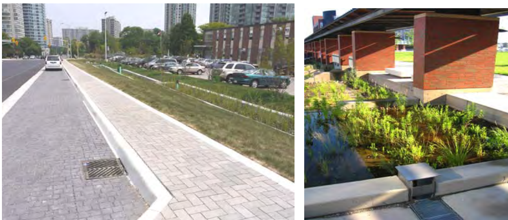
[left] Permeable pavement & bioretention road ROW retrofit on Elm Drive (Mississauga, ON); [right] Linear wetland at University of Ontario Institute of Technology (Oshawa, ON)

Often there is a misconception that LID is not suited to certain land uses or certain soil types, however this is often not the case. In sites with well draining soils, LID practices can significantly improve infiltration and groundwater recharge. In areas with soils with low permeability, other benefits of LID, including filtration, evaporation, detention and/or re-use can be realized. In high density settings like office buildings, green roofs and rainwater harvesting systems can be directly integrated within the building footprint, and other practices, such as permeable pavement can be used to transform existing land uses to those that reduce impermeable area. Furthermore, in areas developed before the introduction of current stormwater controls, LID retrofits are sometimes the only option to permit infill and redevelopment; particularly in cases where little land is available to dedicate to wet ponds.