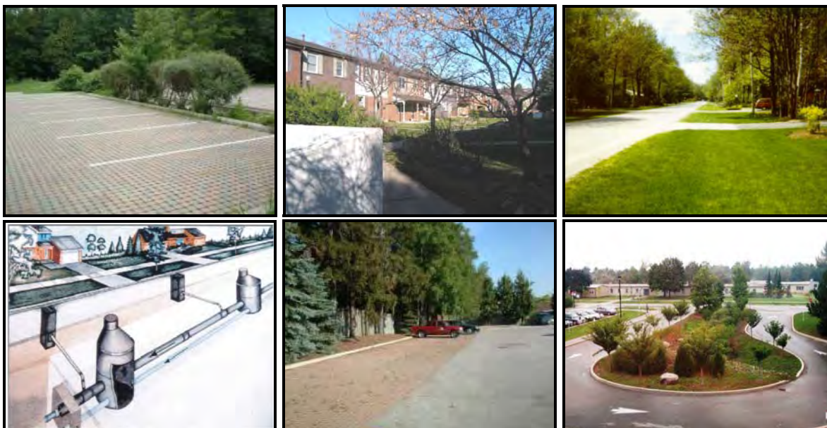
From top left to bottom right: Permeable Pavement at Belfountain Conservation Area (21 years), Green Roof over Below-ground Parking Garage at Gananoque Road Condominiums (30 years), Grass Swale and Perforated Pipe Drainage System in Ottawa (20 years), Exfiltration System in Etobicoke (17 years), Permeable Pavement at Jerrett's Funeral Home (14 years), Bioretention at York University (10 years).

Long term performance monitoring has been conducted at a number of LID sites in Ontario, including some of those included in Exhibit 4. For instance, studies conducted on the grass swale and perforated pipe drainage systems in Ottawa found that they continued to function effectively even after 20 years of service (with little maintenance). 29 As shown in Exhibit 5 video inspections of the perforated pipe found little deterioration, sediment accumulation or any other issue that would impair system performance.